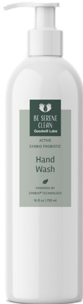
Multiple Sizes Available