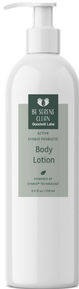
Multiple Sizes Available