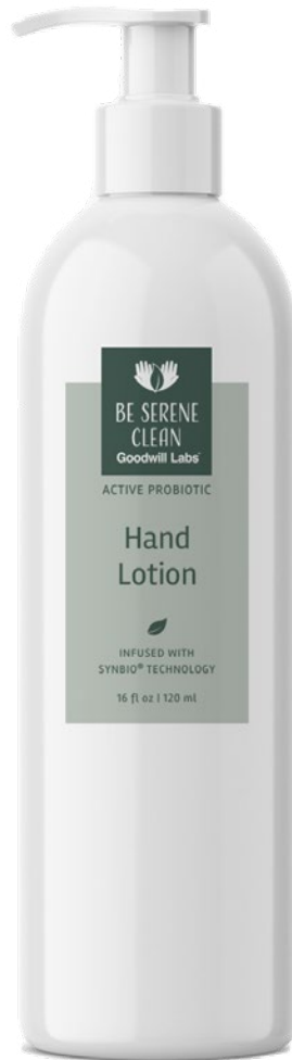
Multiple Sizes Available