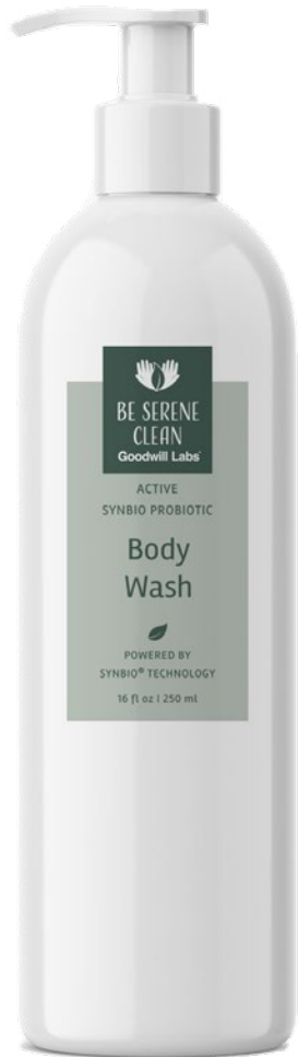
Multiple Sizes Available